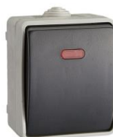
Ref. 3320IL Light Button