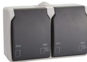
Ref. 3366 / Double 2P+E 16A 250V Ref. 3366F / Double 2P+T 16A 250V