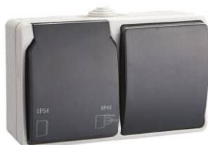
Ref. 3363 / 2P+E + Switch 16A 250V Ref. 3363F / 2P+T + Switch 16A 250V