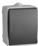
Ref. 3303 / Switch 10A 250V Ref. 3320 / Button