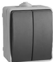
Ref. 3313 Double Switch