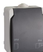
Ref. 3360 / 2P+E 16A 250V Ref. 3360F / 2P+T 16A 250V